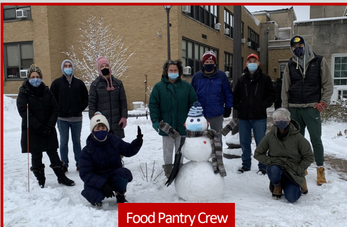
Food Pantry Crew